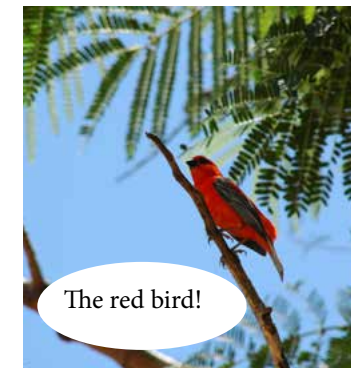
The red bird!