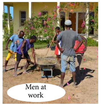
Men at work