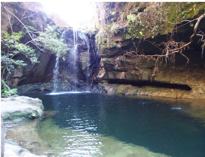
Isalo National Park

Enjoy a day exploring the national park at Isalo. See fascinating plants and more lemurs. Swim in the natural pools in the park or the swimming pool at the hotel.