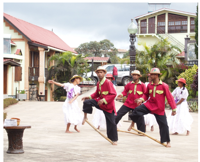
Dancers at Ambositra