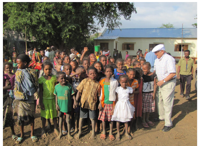
Children at Mahaboboka School