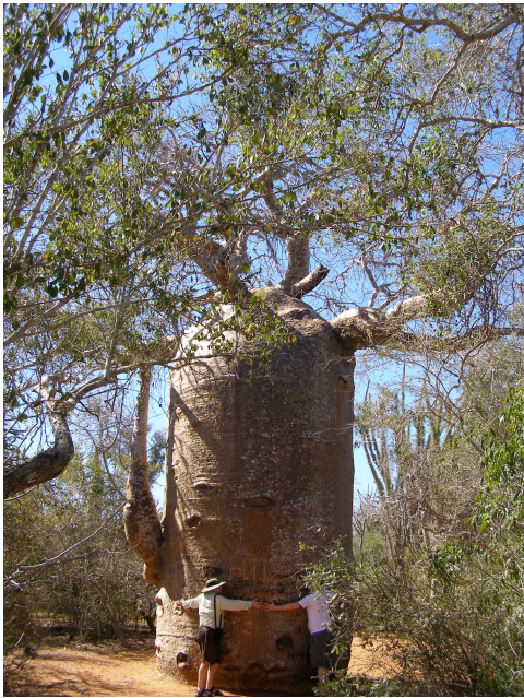
Baobab Tree, Reniala

After lunch we will visit Reniala spiny forest to see many plants and trees which originated in Madagascar, including a 1200 year old baobab tree.