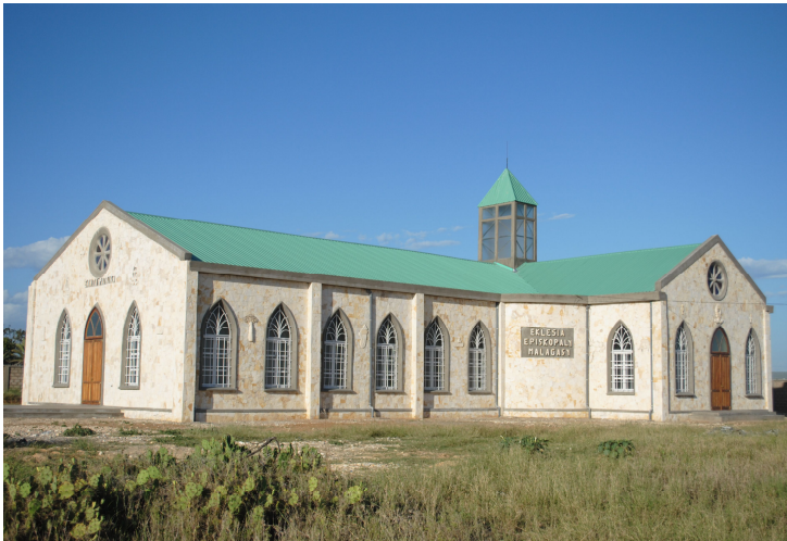
St Patrick's, Cathedral, Toliara

Worship at St Patrick's, Cathedral, Toliara.