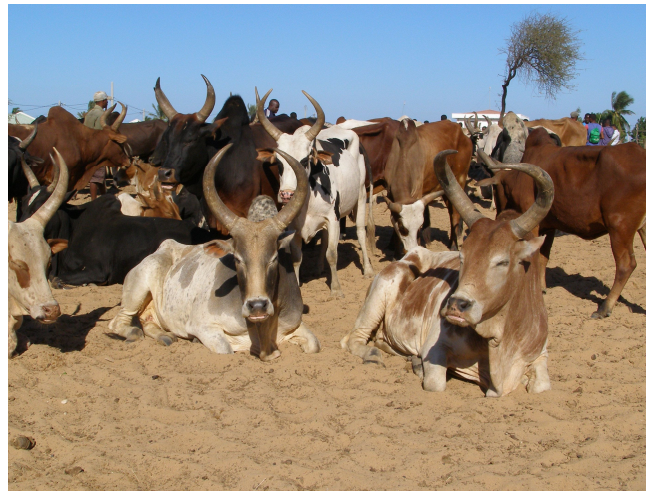
Zebu at Andranomena