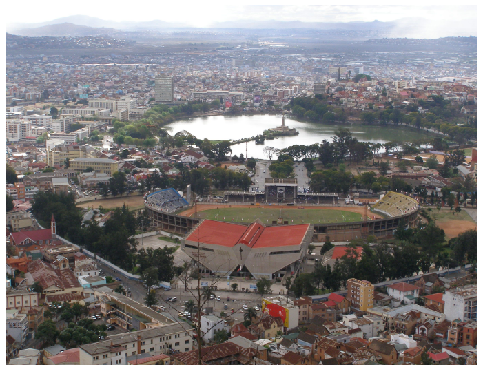
View of Antananarivo